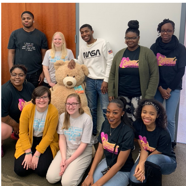
Norfolk State University Hour 2 Empower, January 2020