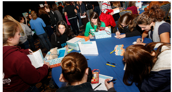
William & Mary students participate in a 2011 event.