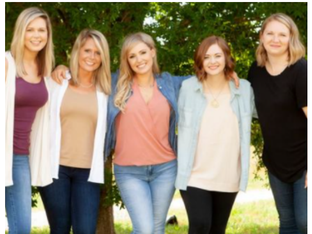
Proximo Marketing Strategies Team, a Charter 10 for 10 Team.

To learn more about 10 for 10, click the link below!